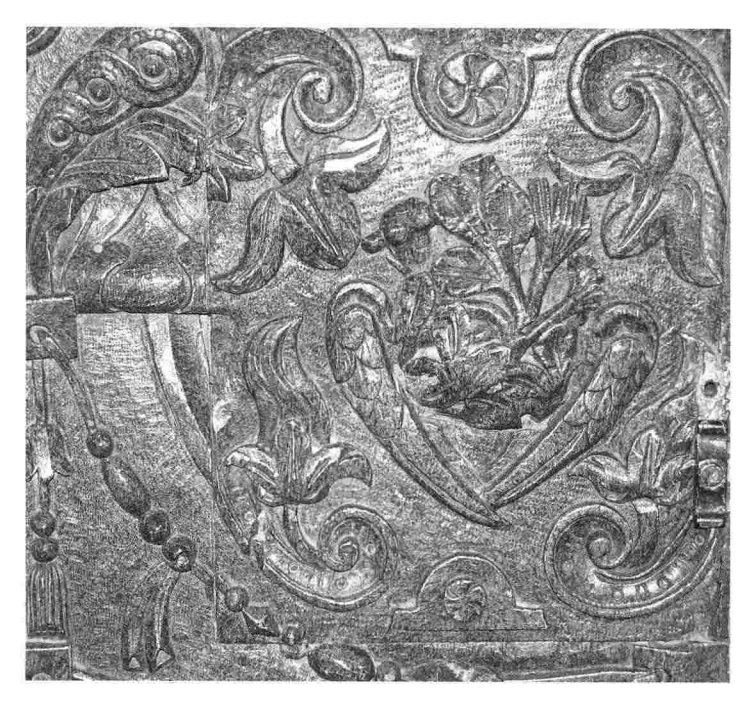
FIG. 62 – Laxfield Church: detail of Wingfield quasi-rebus on an early 16th-century bench end (photo: author).

'Godwins' mansion in the parish of Hoo, in which he was living in 1605. This was demolished by his nephew, probably about 1630.<sup>19</sup>