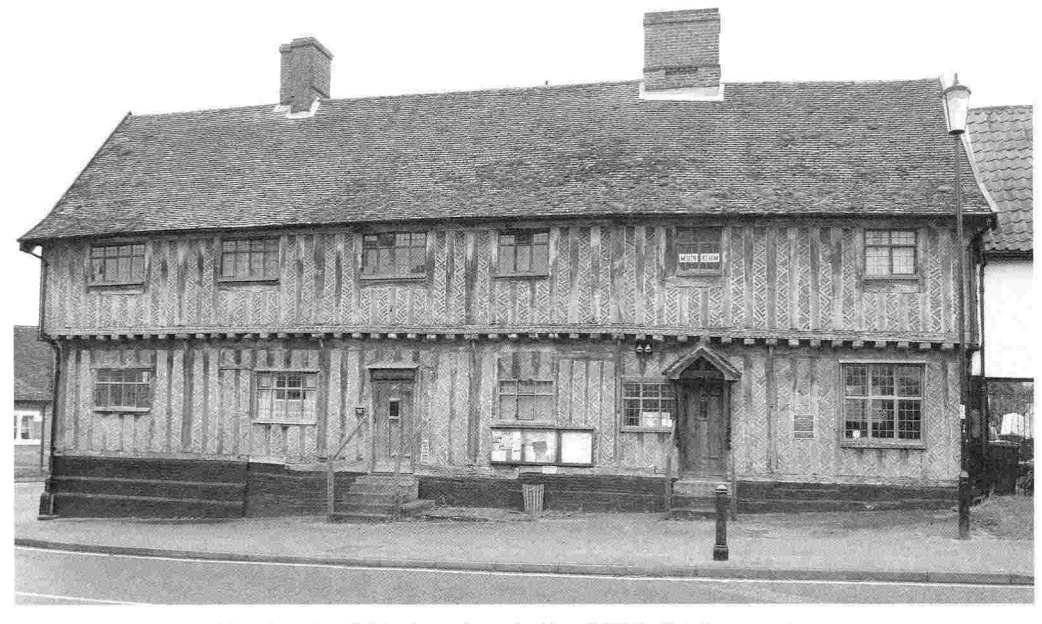
FIG. 65 - Laxfield: view of north side of Gildhall.