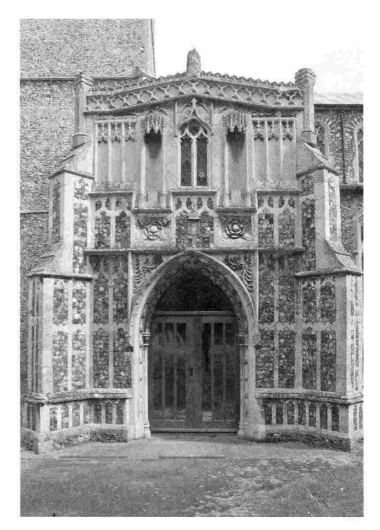
FIG. 60 – Fressingfield Church: view of south porch.