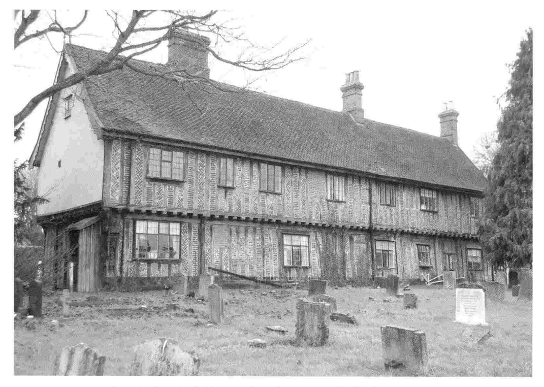
FIG. 64 - Fressingfield: view of north side of Gildhall.

because gildhalls have so often suffered the indignity of conversion to schools, poor houses and other public purposes, these formal rooms have rarely survived in their original state.<sup>30</sup>