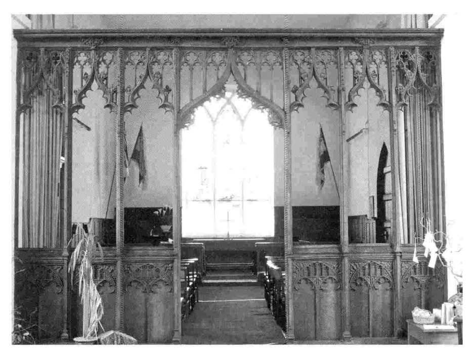
FIG. 63 - Laxfield Church: chancel screen.

Gildes, yerdayes, buryngges and other drynkngges necessary to the profyte of the seid church or p[ar]isshe<sup>*</sup> (Fig. 64).<sup>24</sup> It is curious that these concerns were still in the minds of the Fressingfield parishioners as late as this, given that the extant nave benching must have been put in place during the last quarter of the fifteenth century. Moreover, there exists some documentary evidence for a predecessor to the present gildhall, although there is no absolute certainty of its precise location. An early-sixteenth-century deed suggests that another reason for the construction of a new gildhall was the inconvenience of the distance between the church and 'le olde Gildhall'.<sup>25</sup> Sixteenth- and seventeenth-century legal evidence has been cited to suggest that the location of the latter was that of Bridge Cottage, near the vicarage.<sup>26</sup> Therefore it is not clear why the parish should have needed a new gildhall at this juncture, unless, as is likely, its predecessor was no longer big enough.